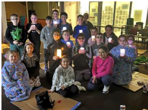
St Joseph the Worker Catholic Primary School, Auburn South

As we conclude the 2022 Winter Appeal, we would like to extend our deepest gratitude to all school and youth communities who put their faith into action and worked to assist people experiencing hardship this Winter. As always, we have been deeply heartened at the generosity shown by supporters of Vinnies in the Metropolitan region and we are so very thankful.